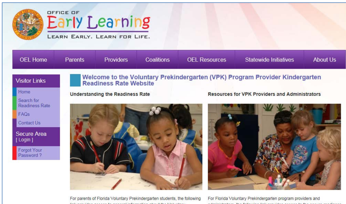
Picture 1. Homepage of Readiness Rate Website

When the provider clicks on the link to log in from the readiness rate home page (Picture 1) the login box will appear (Picture 2). Notice that the second paragraph reads that if this is the first time the provider is accessing the website since December 2015, the provider must register in order to proceed. In order to register the provider will need to click on the link just below that statement.